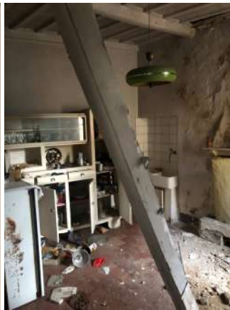
Room 2 (kitchen)