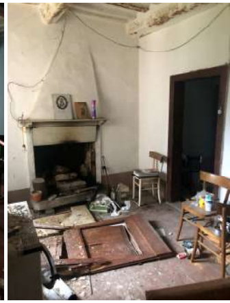
Room 2 (kitchen)