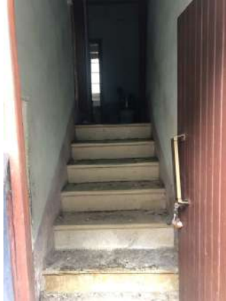
Entrance hall whit stairs