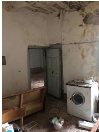
Room 3 (kitchen)